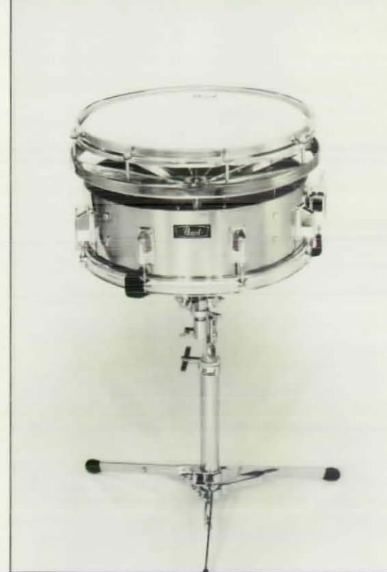
VPS-514 5" x 14" All Purpose Snare, phenolic shell with chrome finish. 14" coated ambassador head. Shown with optional 806 stand.

The Vari-Pitch cannons can be ordered in high pitch VPC-1012 or low pitch VPC-1416 or individually as components.