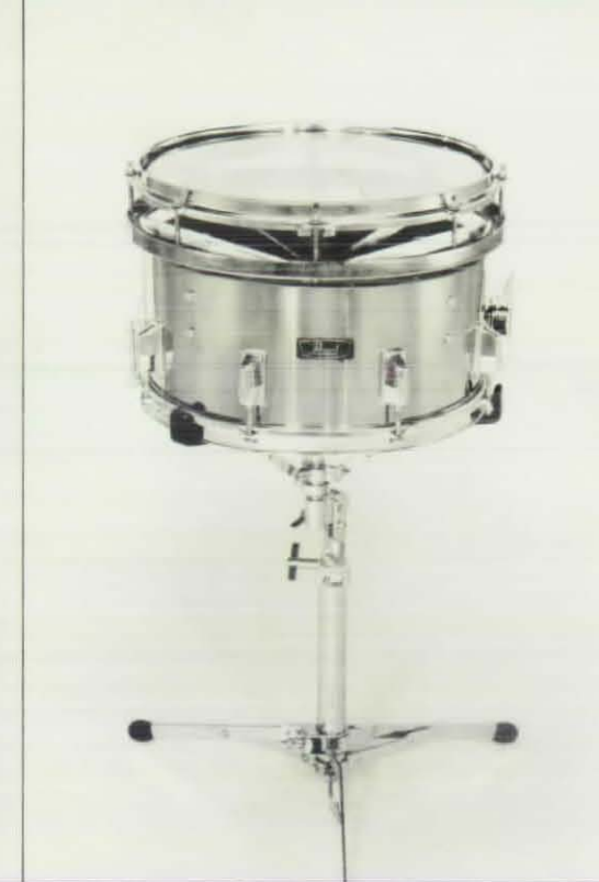
VPS-614 6½" x 14" Rock Snare drum. Phenolic shell with chrome finish. 14" clear emperor head. Shown with optional 806 stand.