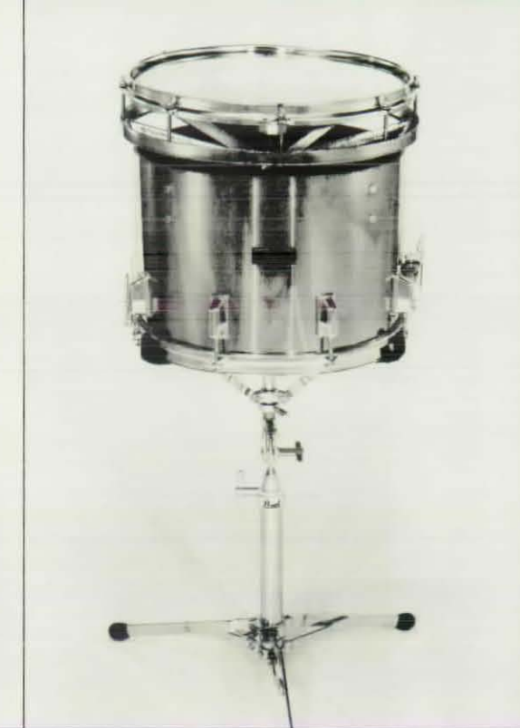
VPS-1014 10" x 14" Hard Rock Snare drum, phenolic shell, with chrome finish. 14" clear emperor head. Shown with optional 806 stand.