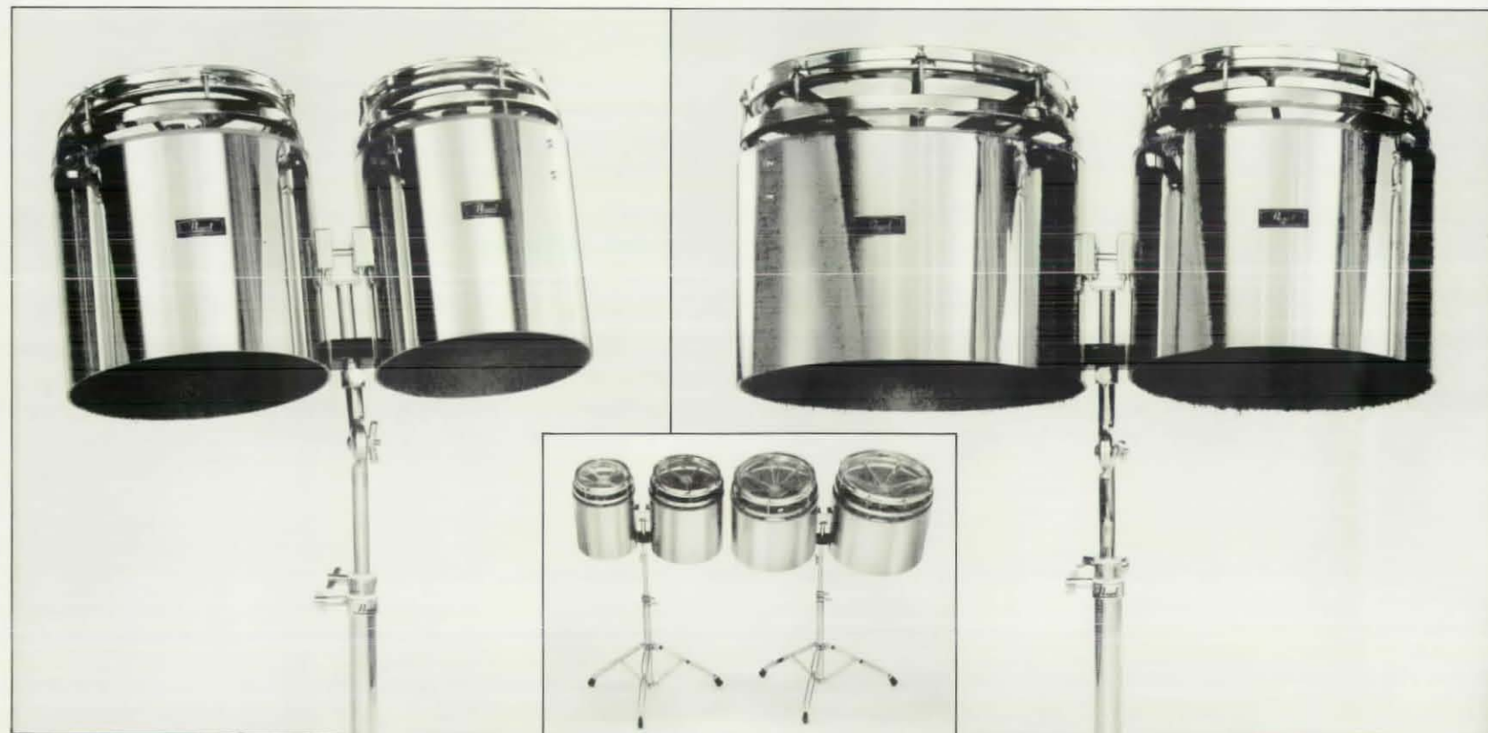
VPC-1012 Hi Vari-Pitch Includes one 10½" x 10" cannon with 8" head, one 10½" x 12" cannon with 10" head. Phenolic shells available in all Pearl colors. FG-111 stand and clear emperor heads standard.