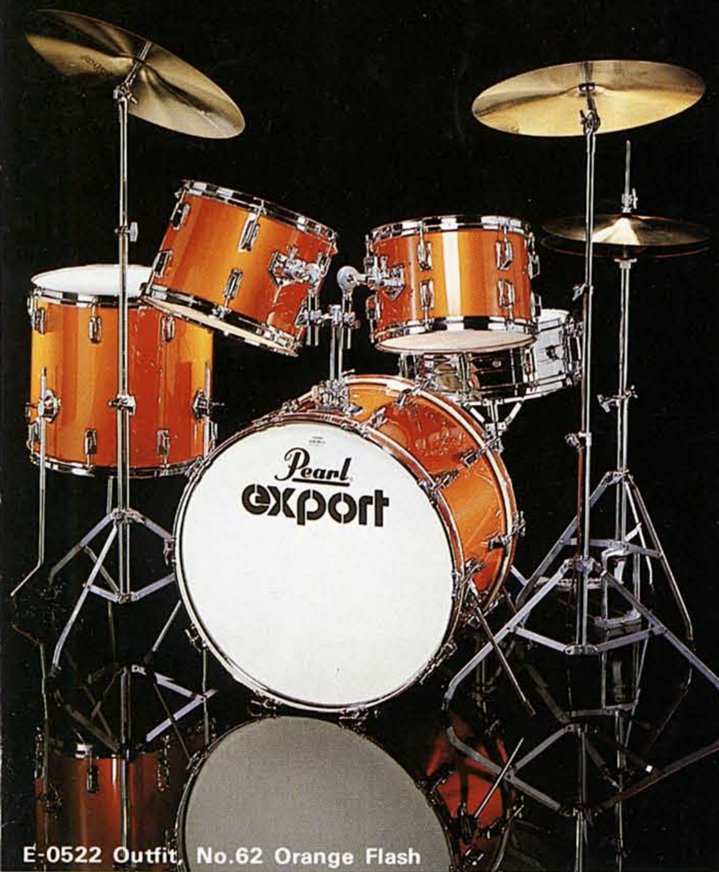
E-0522 Outfit, No.62 Orange Flash