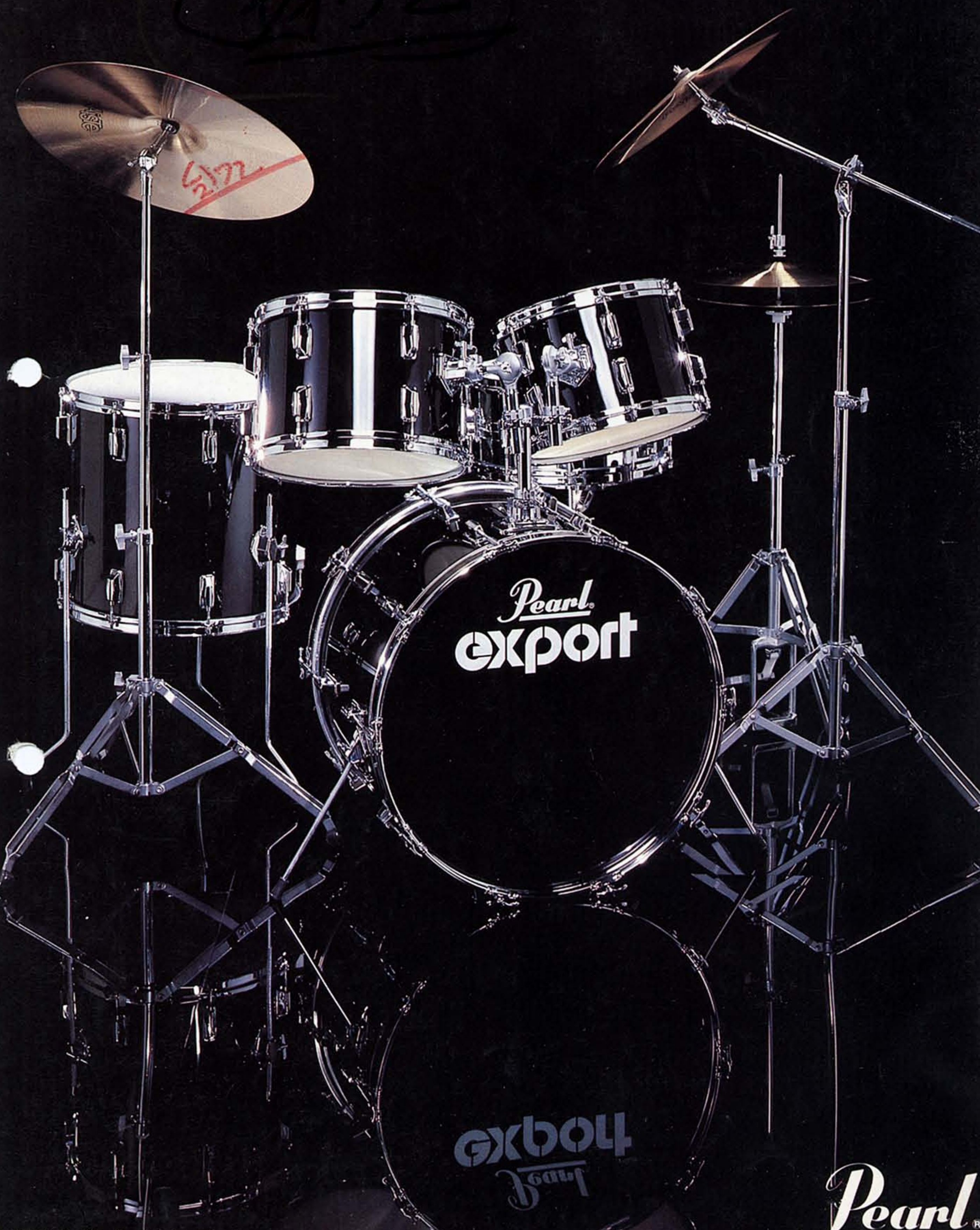
E-1522 Outfit, No.31 Jet Black