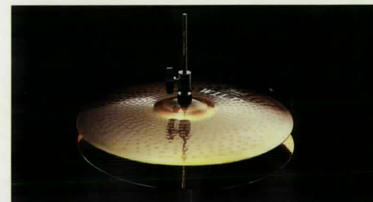
HI-HAT: Provide a tight closed sound for a sharp, crisp rhythm beat. Ghostly powerful in half open position. (Available size: 14" matched pair)