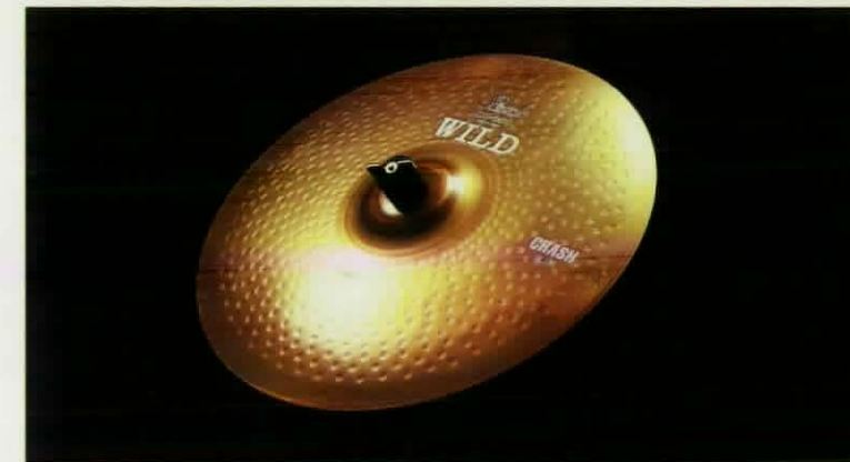
CRASH: Thunderous crash effects. Powerfully piercing and devastating. (Available sizes: 16", 18")