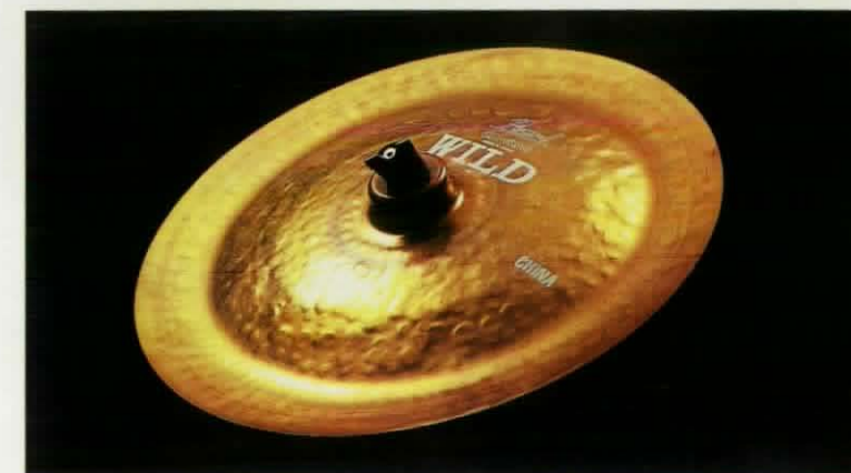
CHINA TYPE: Produces an exotic "RIDE" sound on top side, and a new "attack" crash sound when set up reversed that is quite different from the conventional China type. (Available sizes: 18", 20")