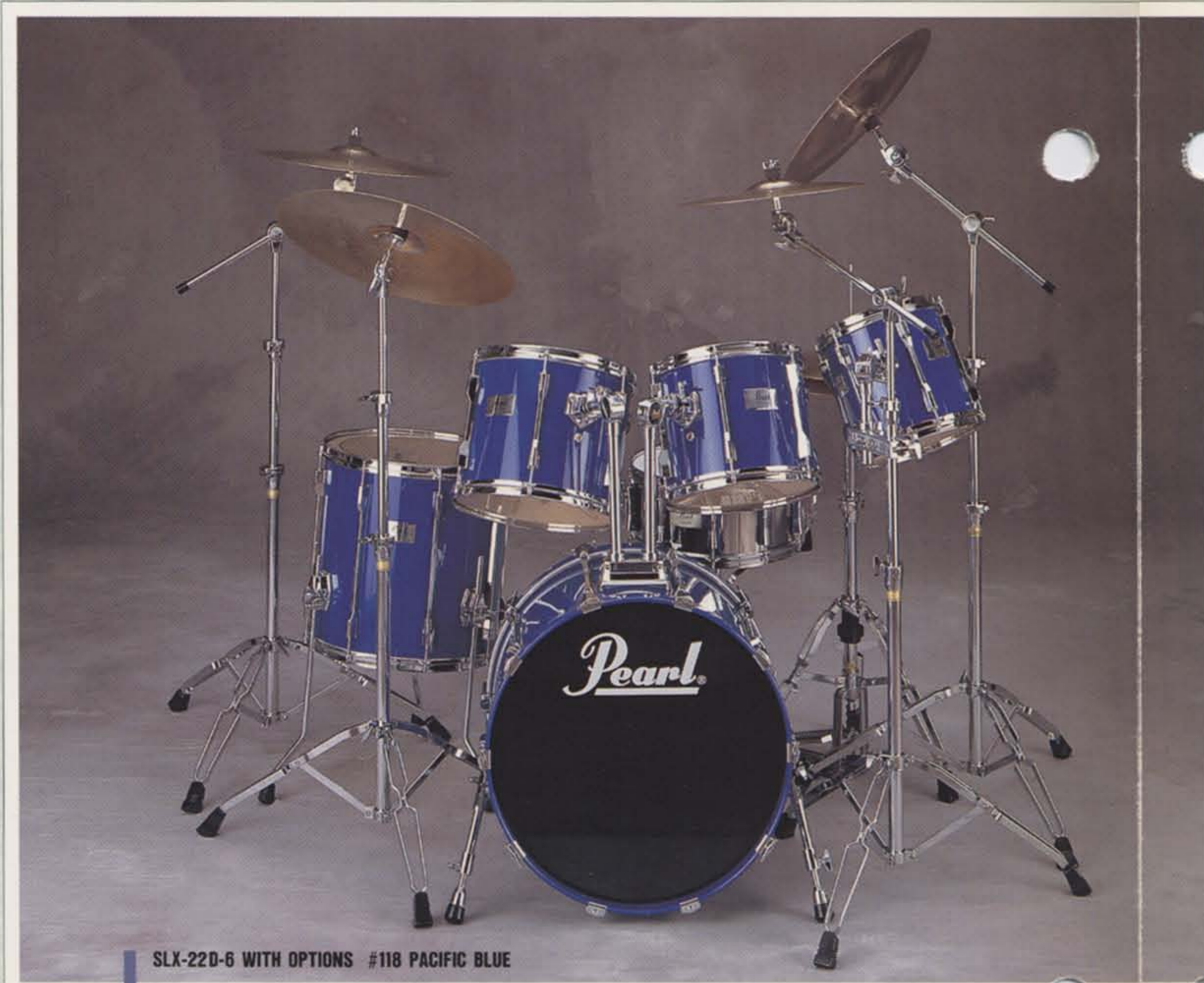
SLX-22D-6 WITH OPTIONS #118 PACIFIC BLUE

SLX-222D: 16"×22" Bass Drum, SLX-210ED: 10"×10" Tom Tom, SLX-212D: 10"×12" Tom Tom, SLX-213D: 11"×13" Tom Tom, SLX-2116: 16"×16" Floor Tom, SX-614D: 6½"×14" Snare Drum, H-850WN: Hi-Hat Stand, P-880: Foot Pedal, S-850W: Snare Drum Stand, C-850W: Cymbal Stand, B-850W: Cymbal Boom Stands (3), TH-95: Tom Holders (2), TH-95S: Tom Holder, AX-20: Adapter