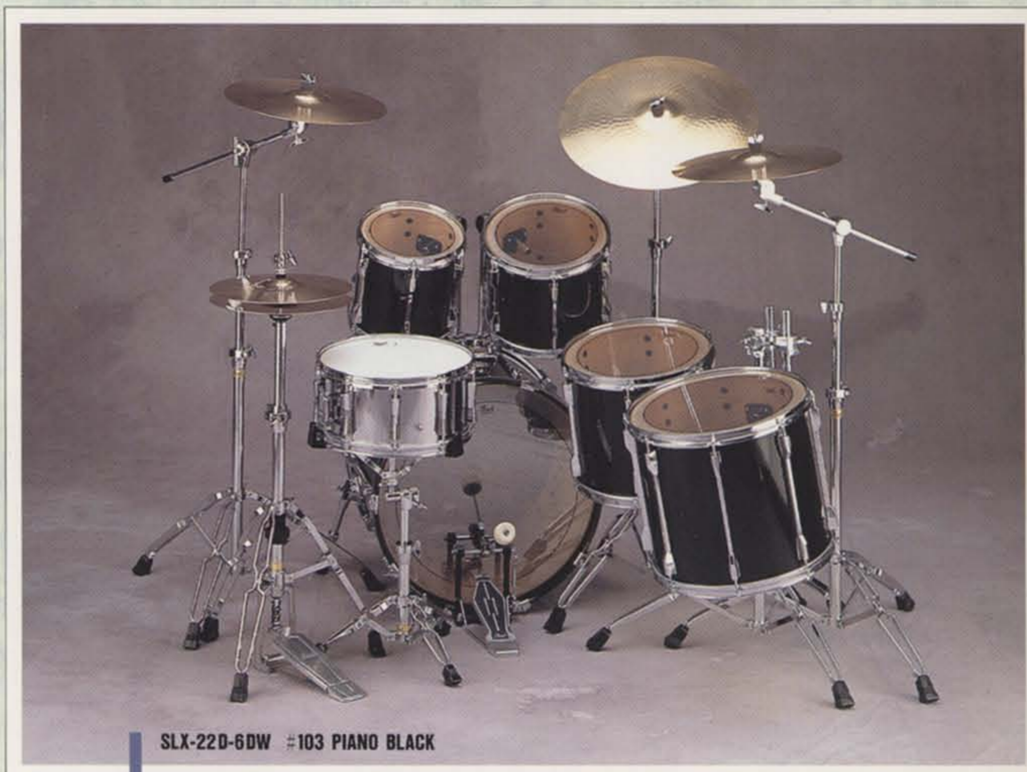
SLX-22D-6DW #103 PIANO BLACK

SLX-222D: 16"×22" Bass Drum, SLX-210ED: 10"×10" Tom Tom, SLX-212D: 10"×12" Tom Tom, SLX-213D: 11"×13" Tom Tom, SLX-2116: 16"×16" Floor Tom, SX-614D: 6½"×14" Snare Drum, H-850WN: Hi-Hat Stand, P-880: Foot Pedal, S-850W: Snare Drum Stand, C-850W: Cymbal Stand, B-850W: Cymbal Boom Stands (3), TH-95: Tom Holders (2), TH-95S: Tom Holder, AX-20: Adapter