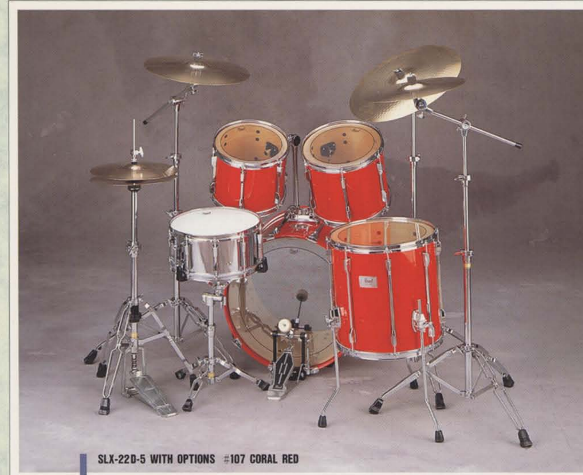
SLX-22D-5 WITH OPTIONS #107 CORAL RED

SLX-222D: 16"×22" Bass Drum, SLX-210ED: 10"×10" Tom Tom, SLX-212D: 10"×12" Tom Tom, SLX-214D: 12"×14" Tom Tom, SLX-216D: 14"×16" Tom Tom, SX-614D: 6½"×14" Snare Drum, H-850WN: Hi-Hat Stand, P-880: Foot Pedal, S-850W: Snare Drum Stand, C-850W: Cymbal Stand, B-850W: Cymbal Boom Stands (2), T-980W: Twin Tom Stand, TH-95: Tom Holders (2)