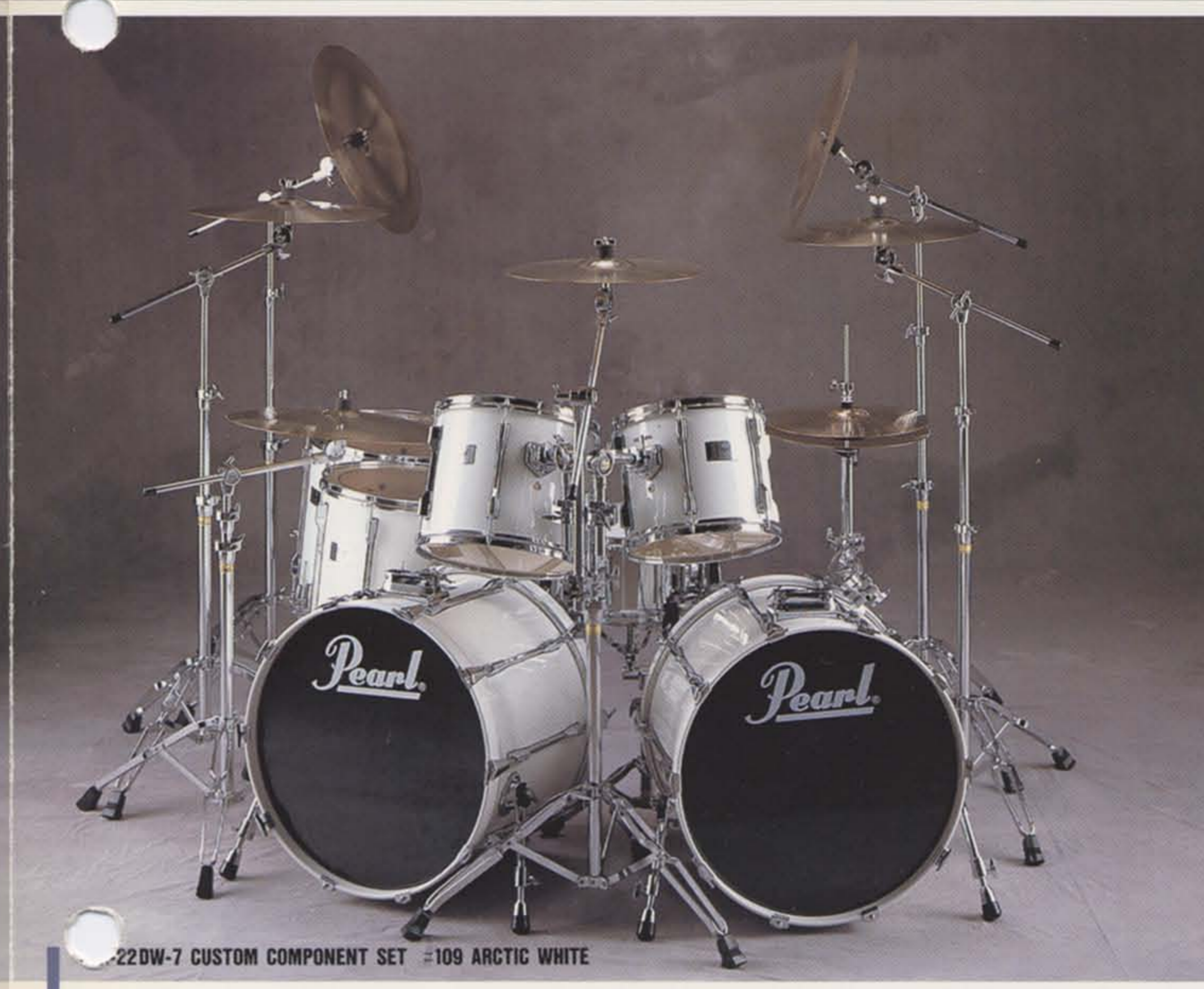
SLX-22DW-7 CUSTOM COMPONENT SET #109 ARCTIC WHITE

SLX-222D: 16"×22" Bass Drum, SLX-212D: 10"×12" Tom Tom, SLX-213D: 11"×13" Tom Tom, SLX-2116: 16"×16" Floor Tom, SX-614D: 6½"×14" Snare Drum, H-850WN: Hi-Hat Stand, P-880: Foot Pedal, S-850W: Snare Drum Stand, C-850W: Cymbal Stand, B-850W: Cymbal Boom Stands (2), TH-95: Tom Holders (2)