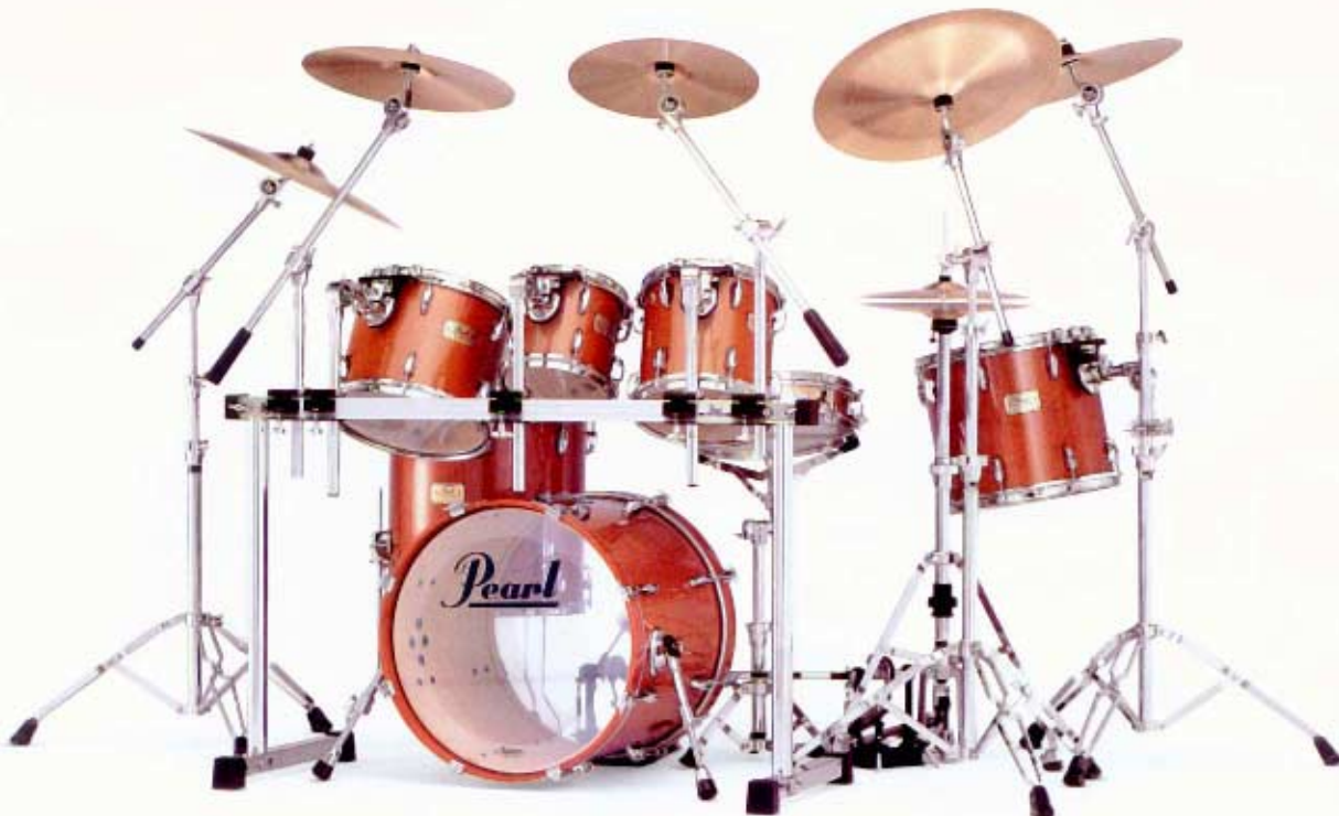
Masters Custom Component Set in #1114 Liquid Amber

and a smooth low end punch that seems to resonate forever. Our exclusive stainless steel counter hoops further accentuate the brilliant tone produced by these fine drums. The classic beauty of chrome plated lugs and hardware provides the perfect complement to an exterior finish that is the most complex offered within the industry today. Masters Custom... a work of art for both the eyes and ears.