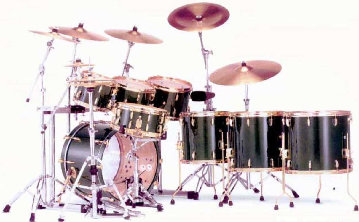
Masters Custom Gold Component Set #126 Emerald Mist

One listen to any Masters Series drumset and we think you'll agree, everything you've heard about this series is true. Its warm, resonant vintage tone and the painstaking quality of the craftsmanship have helped make the Masters Series an instant classic. With the addition of Masters Custom Gold we can now offer the look of 24 karat to complement a sound that is already pure gold.