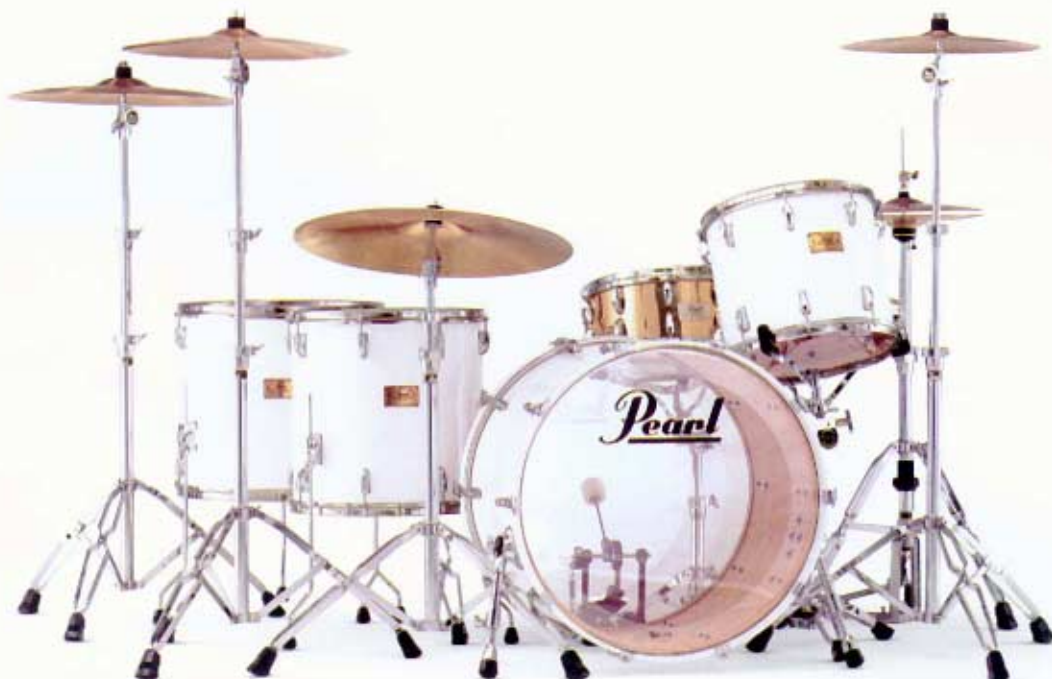
Masters Studio Component Set in #109 Arctic White

midrange, and a pronounced low end presence with lasting resonant sustain. Masters Studio also features our low-mass lugs and hardware designs and our exclusive stainless steel counter hoops as an integral part of the drum and its sound. Choose from eight beautiful colors, a wide array of drum sizes and build your personal set-up. Masters Studio...a different sound, for a different player.