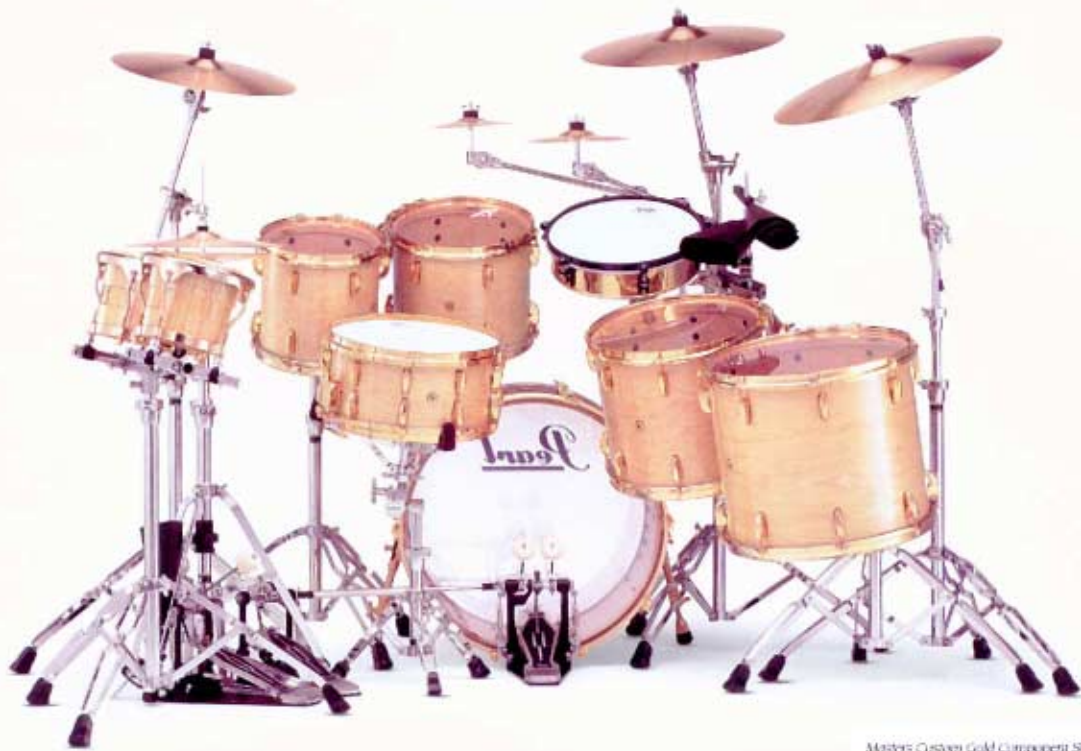
Masters Custom Gold Component Set #4102 Natural

With the Masters Series, you choose each drum, each piece of hardware to create a personal set-up that becomes your signature. The twelve exclusive high gloss exterior finishes reserved for Masters Custom Gold, together with available drum sizes, racks and hardware mounting options, provide thousands of individual set combinations. For the discriminating player, there simply is no substitute for sound quality.