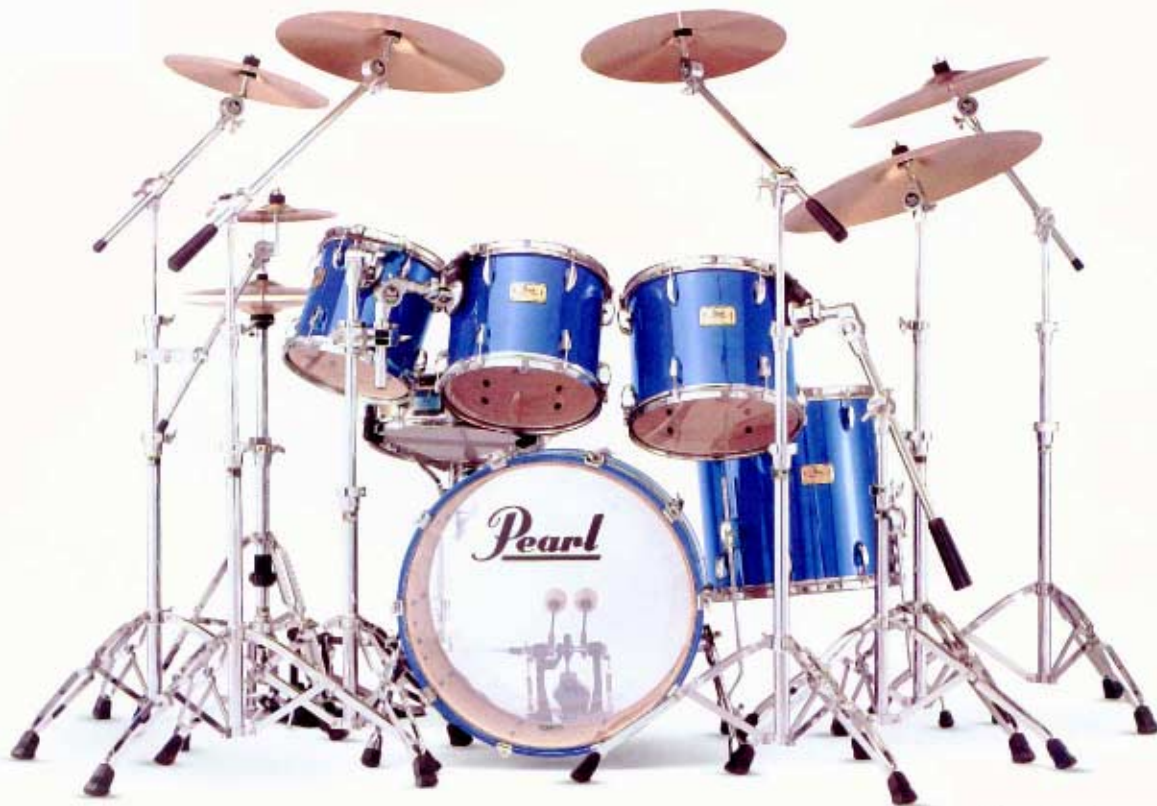
Masters Custom Component Set in #7113 Shiver Blue