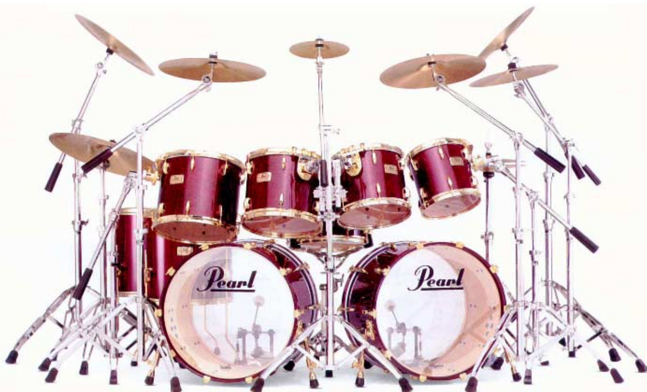
Masters Custom Gold Component Set in #100 Wine Red

and visually exciting drumset available today at any price. The regal looks of Masters Custom Gold perfectly complement its warm, full bodied resonant tone, rich with stunning attack, evenly distributed midrange and a pronounced low end presence. Masters Custom Gold is like nothing you've seen or heard before.