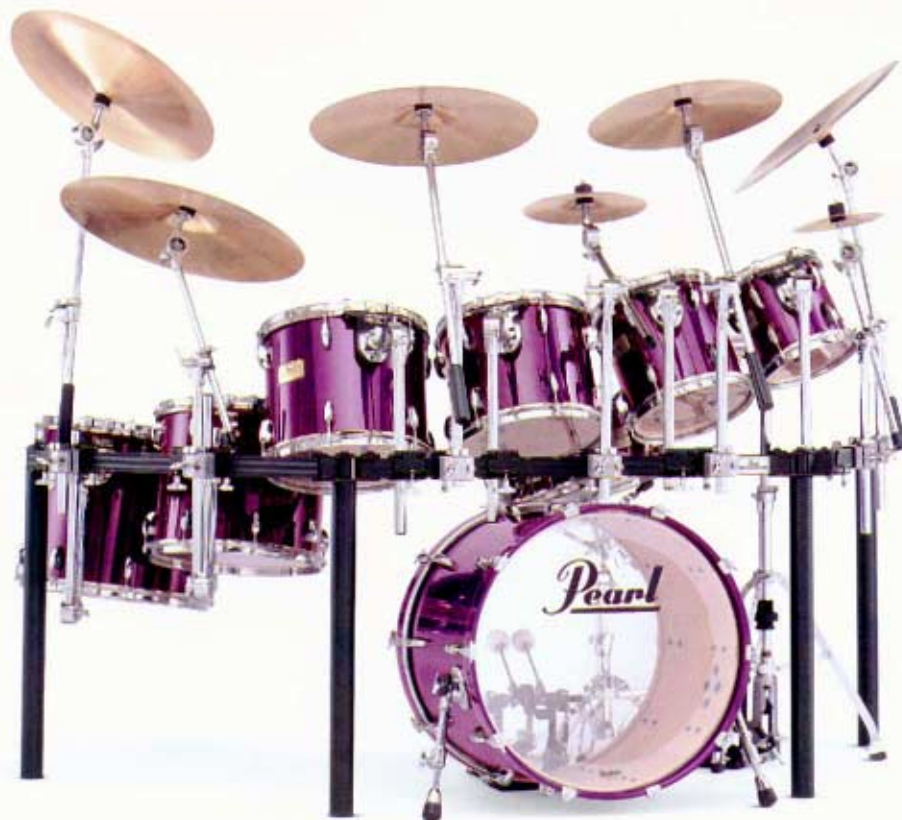
Masters Studio Component Set in #127 Purple Mist