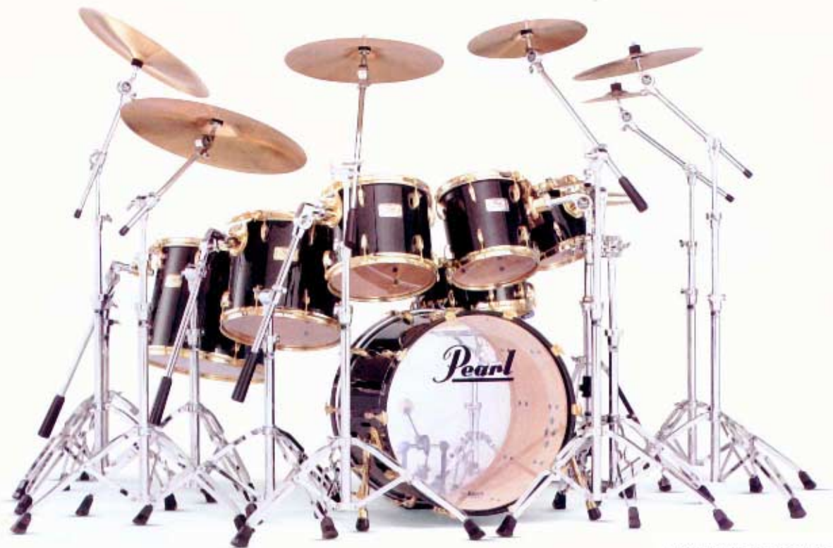
Masters Custom Gold Component Set in #122 Black Mist