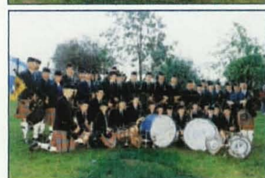
2001 World Champions the Simon Fraser University pipe band (top) proudly displaying their well-earned trophies, and the World Junior Grade Champions (above), the SFU's Robert Malcolm Memorial pipe band